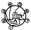
BOTTOM VIEW (7BD)

Maximum Ratings Are Design-Center Values